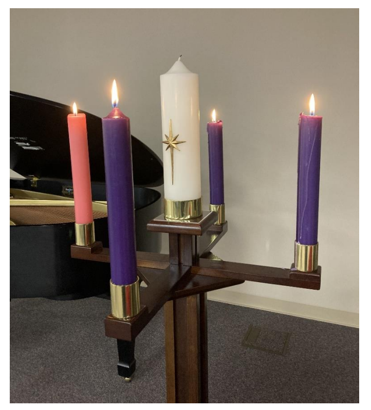
We light the Angels' Candle.