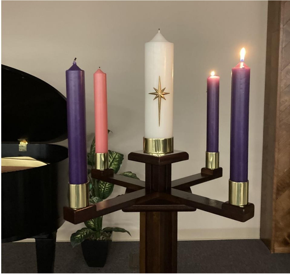
We light the Bethlehem candle.